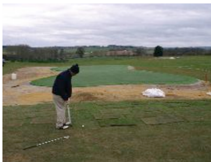
Images on this page: the first site visit to Northamptonshire County GC, the work that was carried out, someone caught on camera chipping onto the new surface and an artificial green

These two clubs, along with others in the county, have begun to identify the need to work closely with the local schools. Using the local club professional to visit local schools to deliver Tri Golf and Xtreme Golf initiatives, there has been a dramatic rise in the number of beginner golfers wishing to access the clubs' facilities. Those clubs wishing to formulate this into a firm link can register with the England Golf Partnership as a 'Community Link Club'. The scheme allows the club to link with local schools and provide an exit route via easy stepping stones