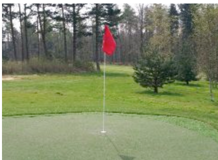
Images on this page: the new par three course at Northamptonshire County GC